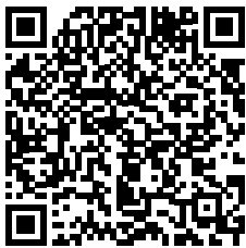
Professional Growth Opportunities Catalogue