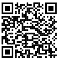
Professional Growth Opportunities Catalogue